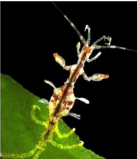
Caprella simia.

DFG's Marine Invasive Species Program (MISP), part of the Office of Spill Prevention and Response (OSPR), works with Moss Landing Marine Laboratories to determine the level of NAS invasions in California coasts and estuaries. Since 2000, they have conducted numerous large-scale surveys of bays and harbors, including San Francisco Bay, and the outer coast. The most recent surveys are the "2011 Bays and Harbors" survey, which is currently in progress, and the "2010 San Francisco Bay" survey. Details and results of all recent and past surveys can be found on the MISP website. The 2010 San Francisco Bay survey revealed four new introduced species: