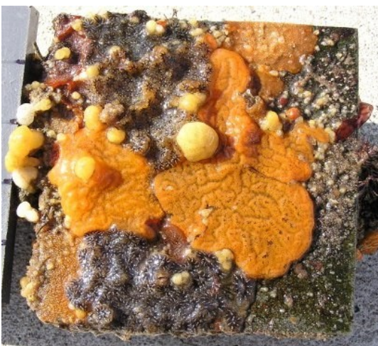
Artificial fouling plate with established species settling on it.

SERC set up artificial fouling plates made of PVC around San Francisco Bay for organisms to settle on and collected paired samples quarterly. Half of the paired samples were sent to specialized taxonomist's laboratories for traditional morphological identification. The second half went to MLML's genetics lab for molecular analysis. Recent advances in genetic analysis now allow millions of individual DNA sequences to be analyzed during a single run. This will allow us to sample whole community populations, such as plankton samples.