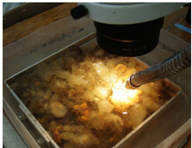
Initial phase of the sorting process.

The two new changes to the MISP sampling design will result in a cost-efficient, faster, and more accurate approach to identifying and monitoring non-native species.