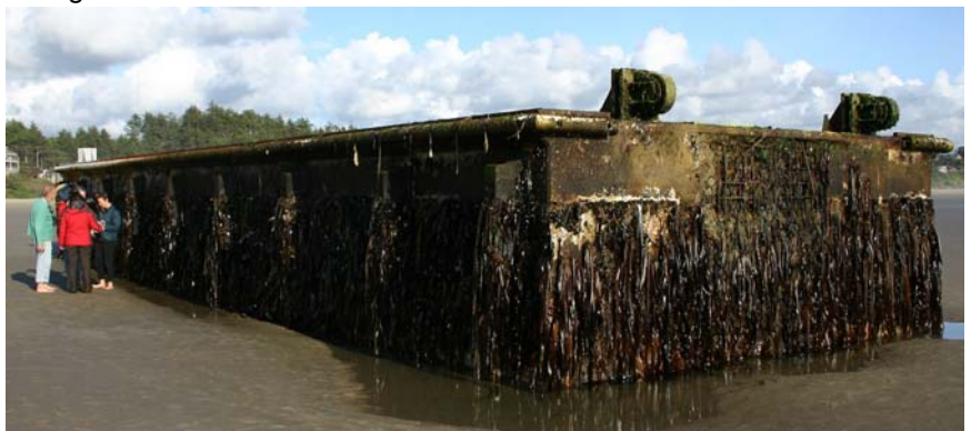
A Japanese dock washed ashore on an Oregon beach following the March 2011 tsunami. The dock was covered in species that could become invasive.

To assist in this effort, anyone who has discovered marine debris should immediately report it to NOAA’s Marine Debris Program via email at DisasterDebris@noaa.gov . NOAA will forward the report to the appropriate authorities. It is possible debris could include hazardous material, therefore you should use caution around suspected debris. For more information on Japan Tsunami marine debris visit NOAA’s Marine Debris Program website.