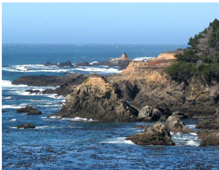
Mendocino headlands

In this issue of Eye On Invasives we are introduced to some of the organizations working together to prevent the introduction of invasive species, monitoring for new introductions, and a few of the species California is confronted with.