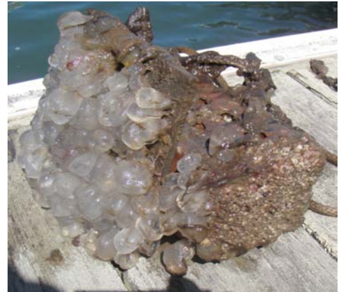
Side view of an artificial fouling plate with established species.

Although morphological analysis will always play a prominent role, it does have limiting factors. The process for identifying organisms from large-scale surveys can take up to a year. There are a lot of samples and the process of identifying individual organisms is slow. It can also be difficult, and in some cases, impossible to identify specimens that are damaged during collection because key morphologic characters may be lost. Other challenges include identifying juvenile specimens and distinguishing between morphologically identical species in the San Francisco Bay.