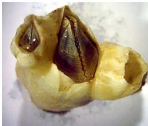
Amphibalanus eburneus.

Amphibalanus eburneus , also known as the ivory barnacle, has been found in Richmond and San Francisco marinas. Native to the North Atlantic, A. eburneus was first found in Colorado Lagoon (Long Beach) and Huntington Harbor. The