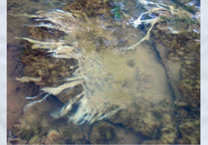
Thick mat (advanced stage) of didymo attached to rock.

Algae – Appears slimy, but feels coarse, like damp wool. Can look like wet toilet paper in streams.