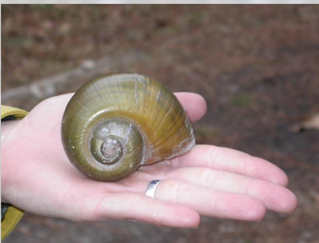
Adult channeled apple snail shell.