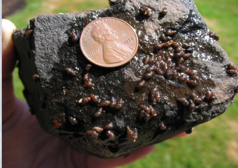
Dense colony of New Zealand mudsnails attached to the underside of a rock.

Shell – Single, elongated, right-handed coiling shell, usually consisting of 5-6 whorls, and an operculum (flap covering the shell opening).