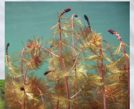
Stems and flower spikes.

Stems – Branched and 20-30” long, reddish-brown or whitish-pink.