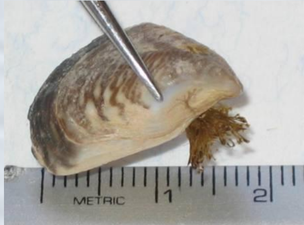
Quagga mussel showing 'threads.'

Dreissena rostriformis bugensis and D. polymorpha