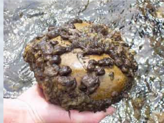
Clumps (early stage) of colonized didymo.