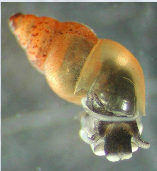
Elongated shell with 5-6 whorls.