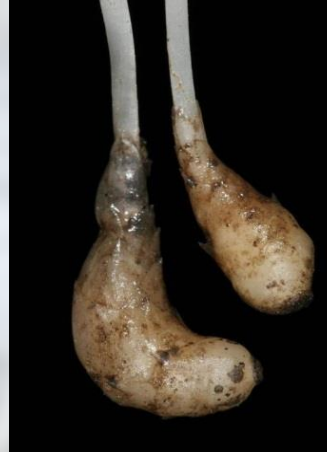
Root tubers.