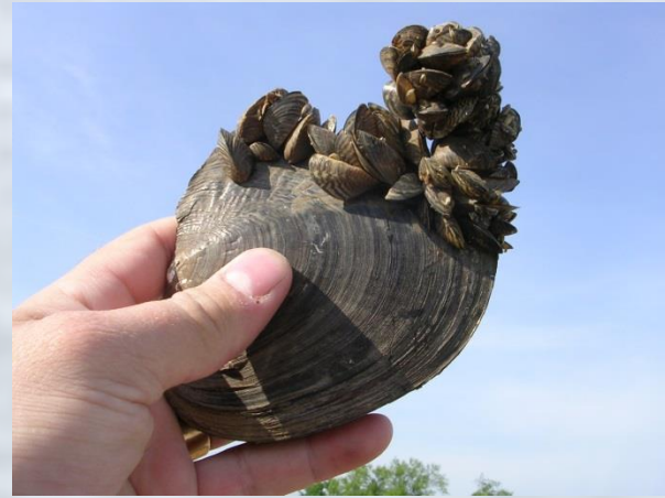
Zebra mussels attached to native mussel.

Shell – 2-shelled (bivalve), may have dark colored “threads” on one edge.