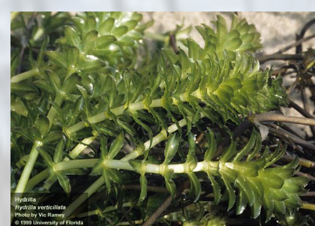
Hydrilla stems.