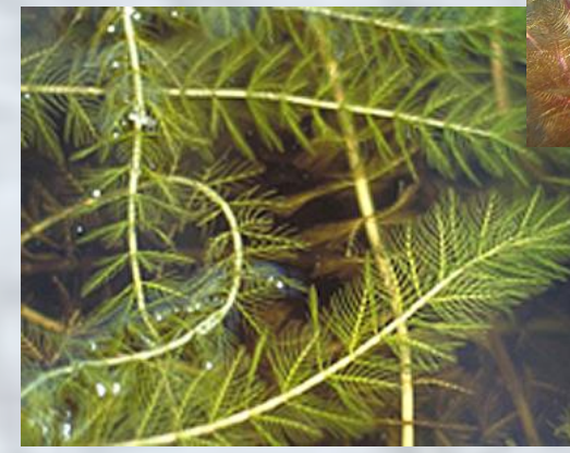
Stems are densely branched.