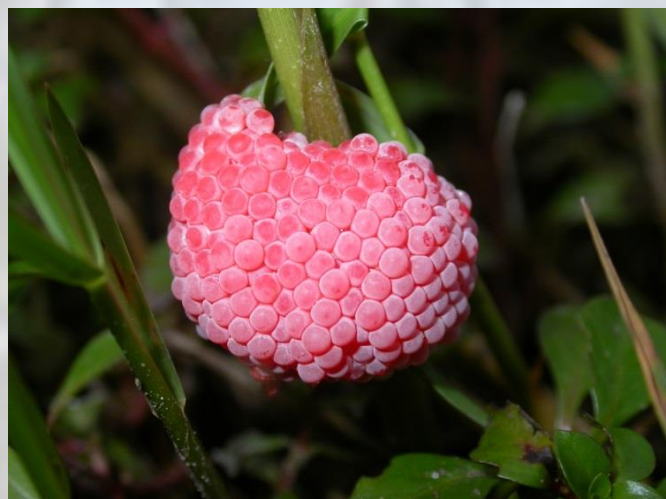
Egg mass.

Shell – Single shell with compact, deeply grooved whorls.