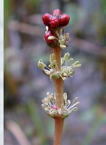
Flower spike.